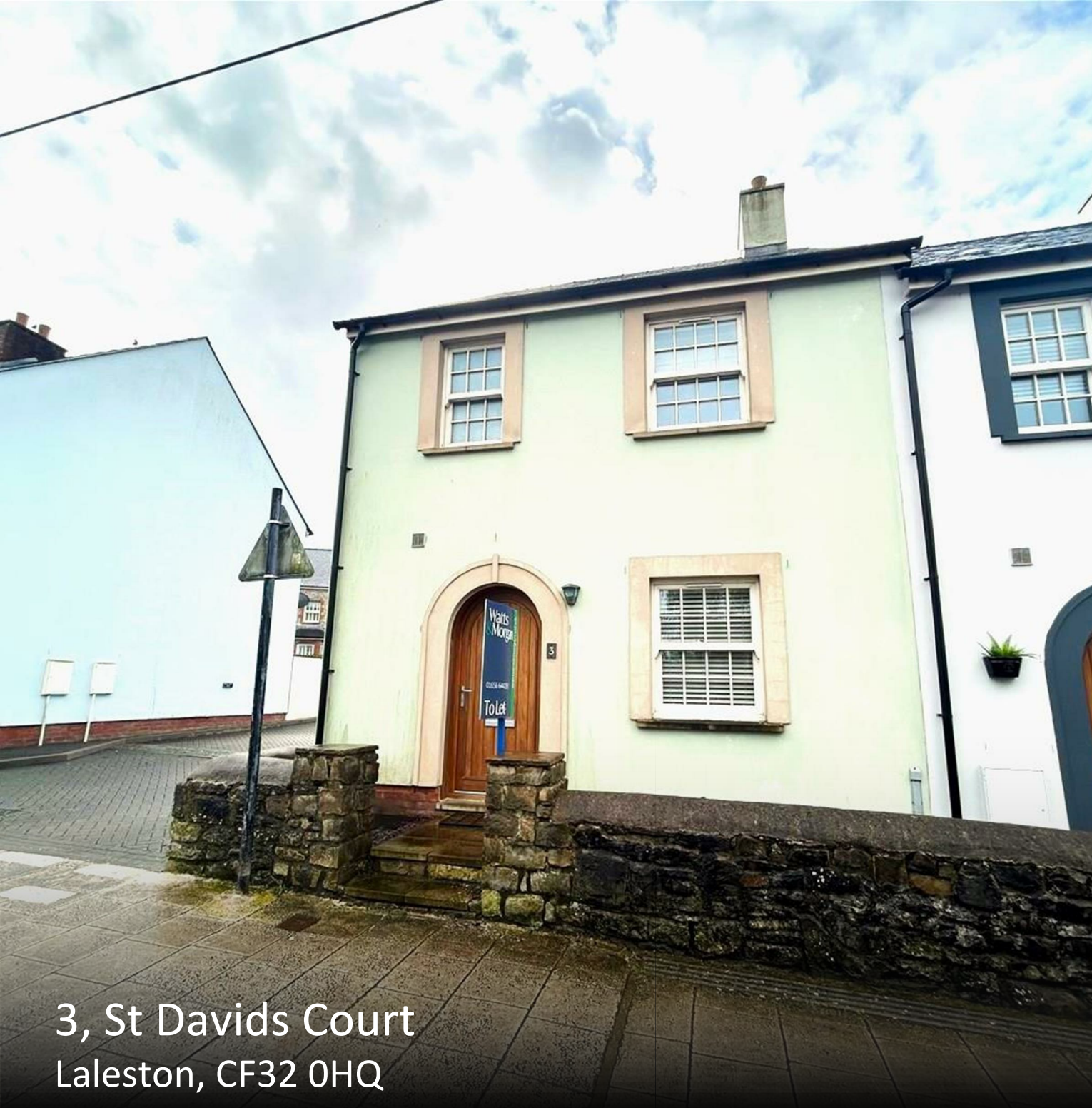
3, St Davids Court Laleston, CF32 0HQ